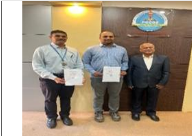
MoU between PCCoE Civil and M/s. Kshirsagar Enterprises on 6th February 2024. Scope of MoU- Technical Internship at Site/Placement/Expert Lecture/Field Visit