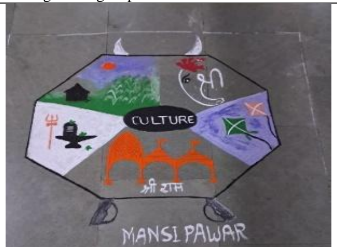
Events full of great art, culture and dedication Civil Department got their 12 Champions