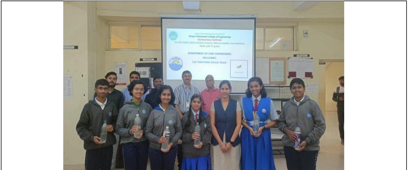
S. B. Patil School students visited Environmental Engineering Laboratory on 16th January 2024