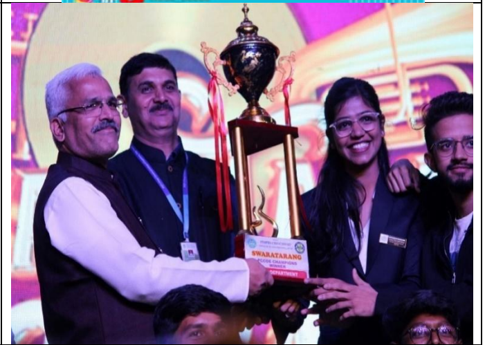
SwaratarangPCCoE Champion awarded to Civil Engineering Department for 2023-24