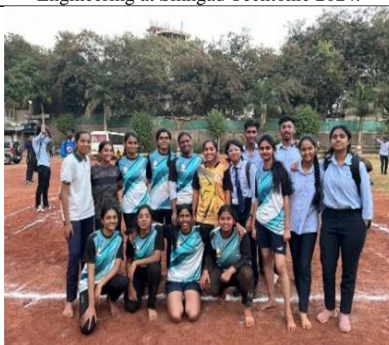
S.Y. B-tech Civil Girls are PCCoE Fitness First Kabaddi Champions declared on 6th February 2024.