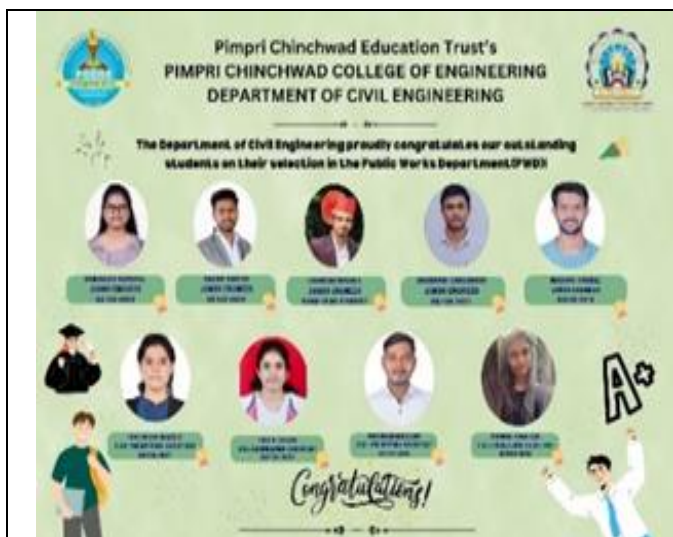
The department of Civil Engineering proudly congratulate outstanding students on their selection in Public Works Department (PWD)