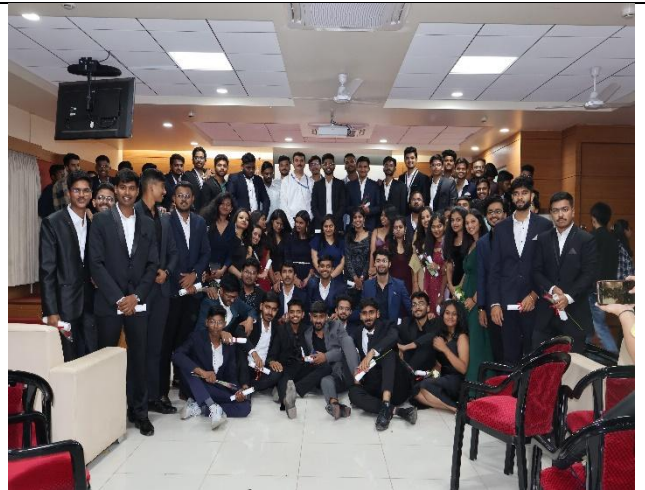
Farewell Party for Final Year B-tech Students , 18 th April, 2024.