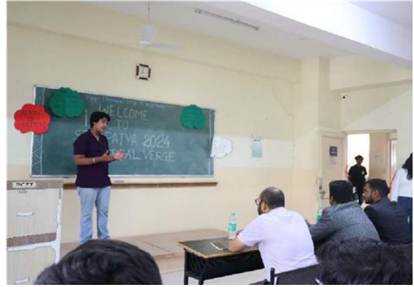
Name of Event: Verbal Verge