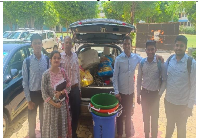
A total of 94 kgs of e-waste collected by students were handed over to M/s Electrofine, Pune on behalf of M/s. Greenscape Eco Pvt. Ltd. Pune on 8 th May, 2024.