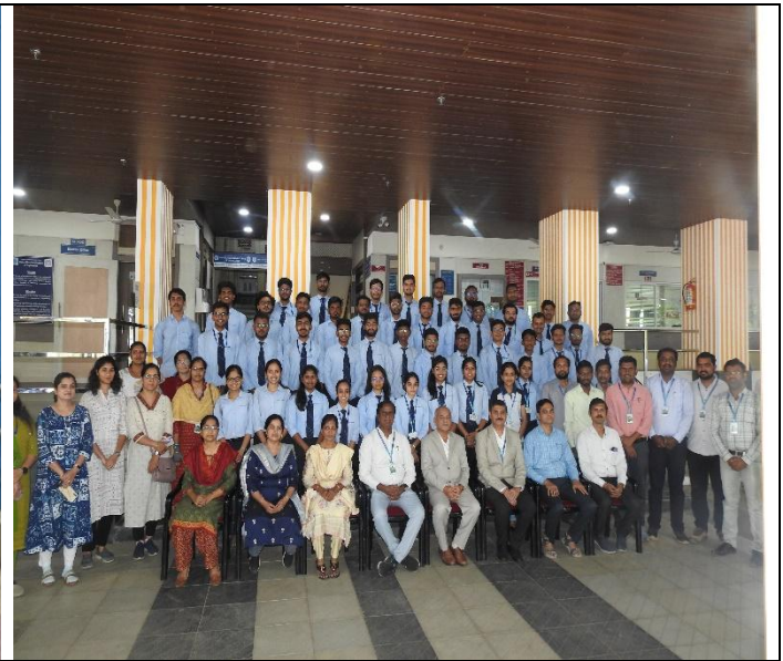
Group Photo – Civil Engineering Department AY 2023-24