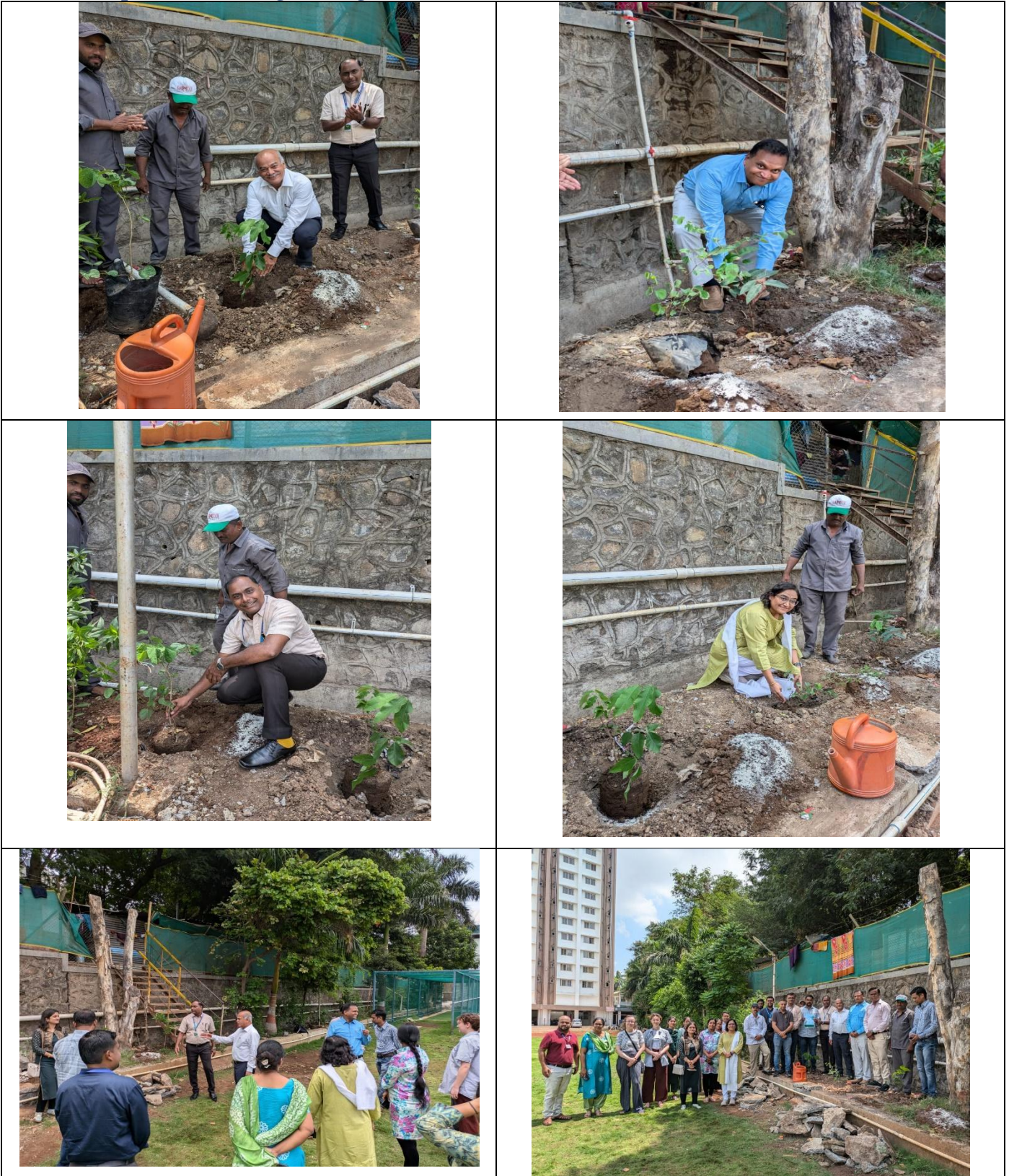
PCCoE Civil Engineering Department celebrated World Environmental Day on 5 th June 2024 through tree plantation, which is a vital strategy for the mitigation of global warming organized by CiESA