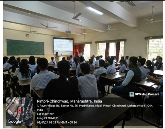
Guest Lecture on " Placements and Higher Studies Opportunities through GATE and Other Competitive Exams, by I2E Pune for S.Y B-tech Civil on 8 th January 2024.