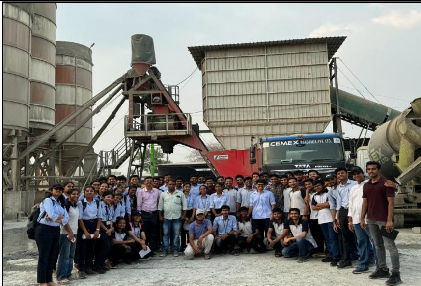
S.Y. B-tech Civil students visited the concrete RMC plant named CEMEX Readymix Pvt Ltd. At Punawale, PCMC on 17 th April, 2024.