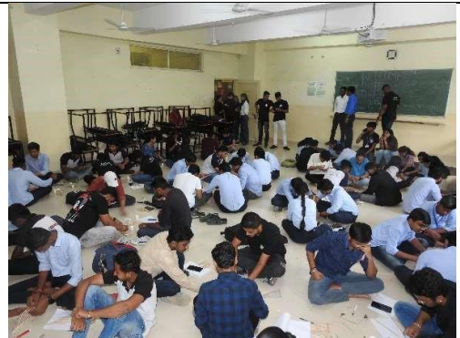
Bridge Build Battle