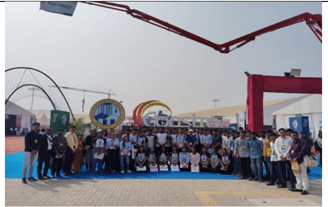
Group photo students and faculties at Constro 2024 on 6 th January 2024.