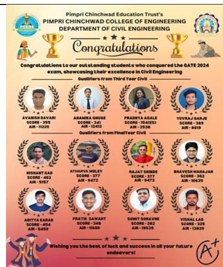
Gate 2024 Rankers T.Y B-tech Civil & Final Year B-tech