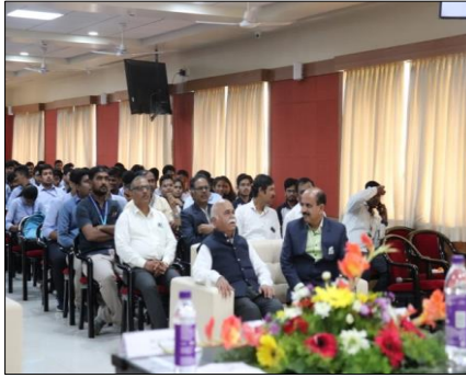
Audience Students – BE, TY , SY and from other institutes