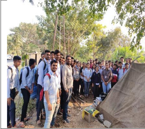
Group Photo on Site