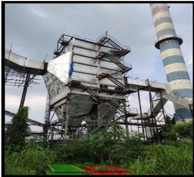
Electrostatic Precipitator (ESP) at the industry