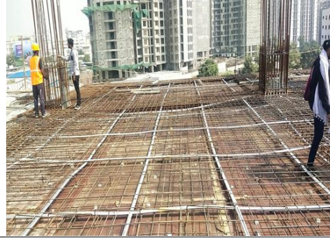
Tendon Profile of PT Slab