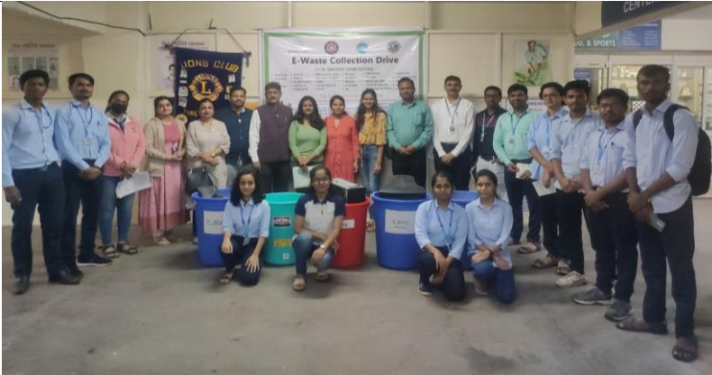
E-waste Collection Drive at PCCoE Pune Campus