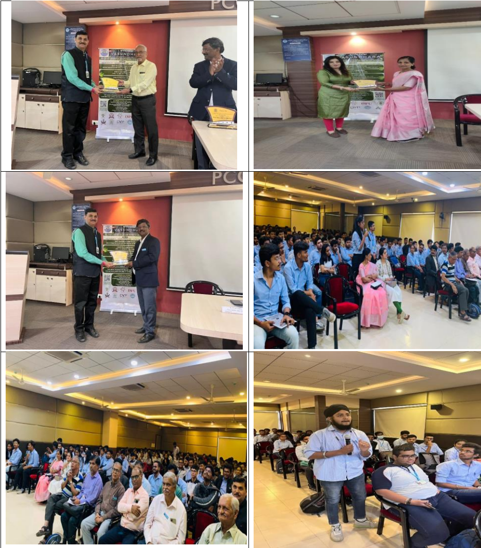
Open Forum Discussion on 'Water Management Challenges Strategies and Mitigation for PCMC' and Challenges and Opportunities in Municipal Solid Waste Management' on 10 th November, 2022.

PCCoE Civil Engineering and NSS -Kirloskar Vasundhara International Film Festival (KVIFF)