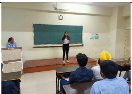
Students Interaction Session