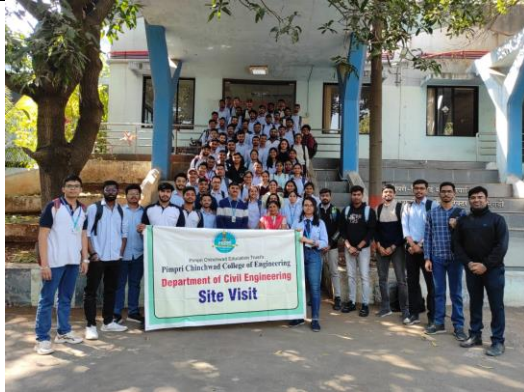
Site Visit for T.Y. B-tech Civil students at PCMC's WTP on 11 th January, 2023