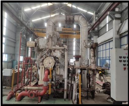
Turbine at the co-generation electricity plant

Site visit organized for B.E. Civil students under course 'Elective IV- Design of Prestressed concrete structures' at Prestress concrete PT two-way slab, Kretos Mall, Lakshmi Chawk, Hinjewadi on 19 th November, 2022.