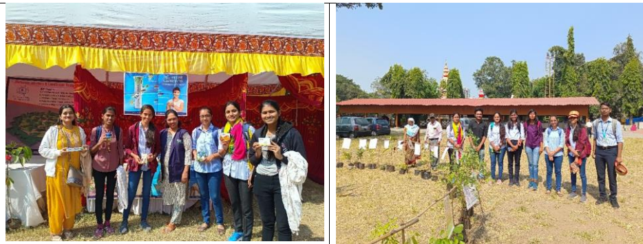
Green Bazar and Medicinal Plant Exhibition at Morya Gosavi Samadhi Sthal , Chinchwad