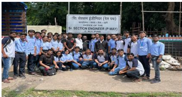
Pune Railway Junction on 11th September 2022