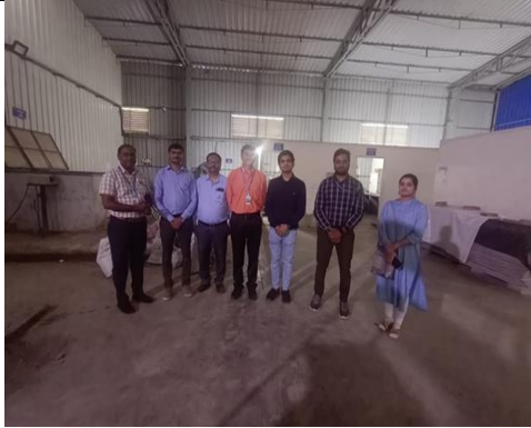
Visited NABL Accreditation material testing Lab