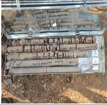
Core Box – Collection of disturbed rock cores