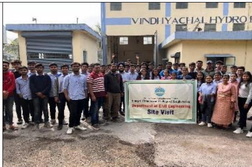
Site visit to Chaskaman Hydropower Plant, Rajgurunagar, Dist- Pune for S.Y. B-tech Civil