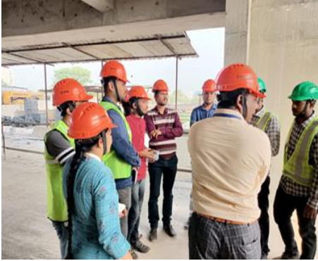
Safety Aspects and Planning approvals

Site visit organized for F.Y. M-tech Civil CM students under course "Construction Techniques' and 'Project Planning and Management in Construction" at High Rise building on 3rd December, 2022