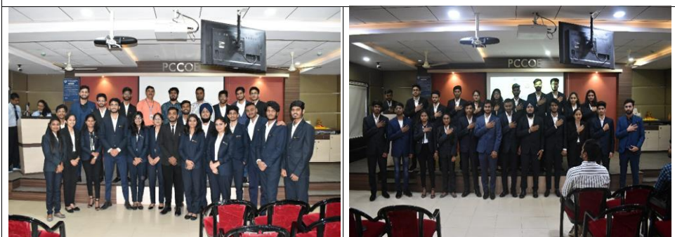
Installation Ceremony of team CiESA organized on 13 October 2022 for the purpose of installation of new team CiESA to the department