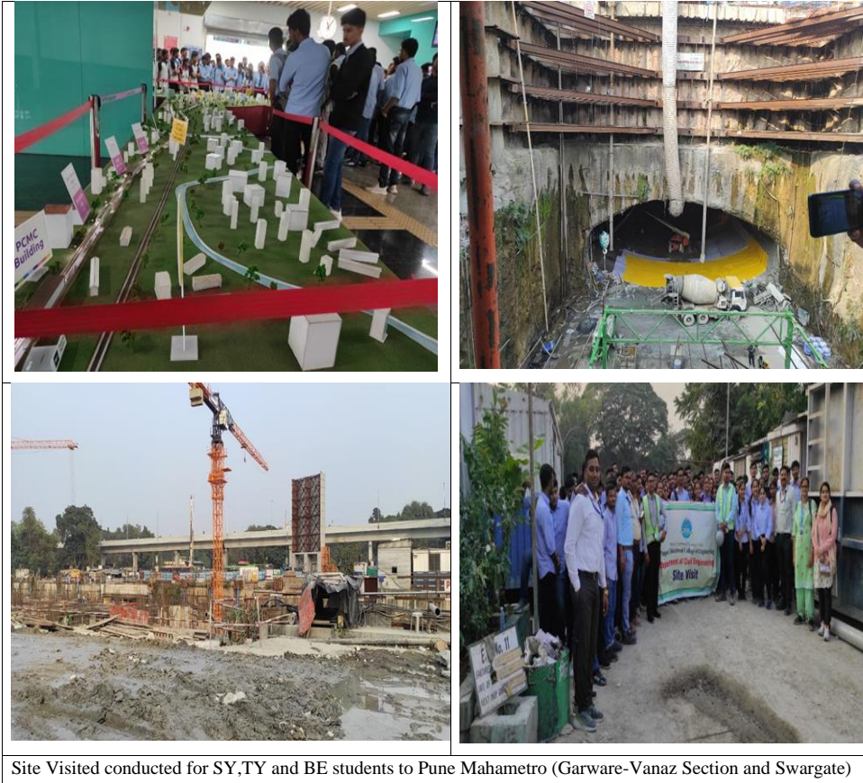
Site Visited conducted for SY,TY and BE students to Pune Mahametro (Garware-Vanaz Section and Swargate)