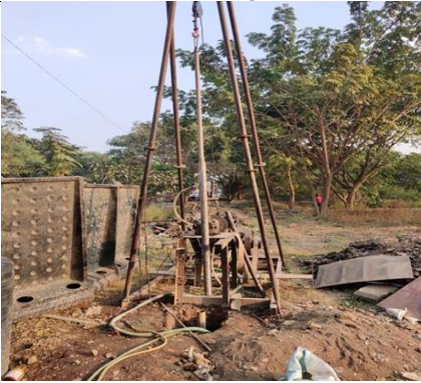
Core Drilling Machine for collecting disturbed soil sample

PCCOE – IGS Student chapter conducted the site visit to understand the construction process of Raft Footing, near PCCOER, Ravet, Pune on 22th March 2022.