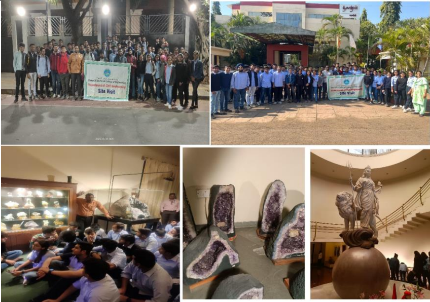
Site visit organized for S.Y. B-tech Civil students under course 'Engineering Geology' at Gargoti, The Mineral Museum – D-59, MIDC Malegaon, Sinnar, Nasik on 3 rd January, 2023.