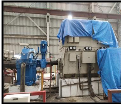
Alternator at the co-generation electricity plant