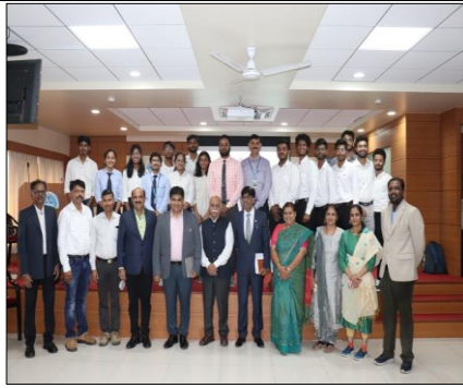
Group Photo – Organizing Team

PCCOE – IGS Student chapter conducted the site visit to understand the construction process of Raft Footing, near PCCOER, Ravet, Pune on 22th March 2022.