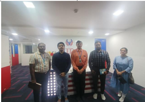
Training/skill development institute by MSR Capitals