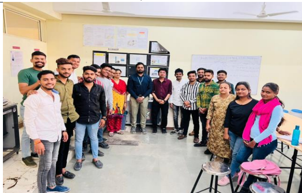
PCCoE Civil department, Transportation Lab conducted transportation engineering practical, explanation and demonstration for around 15 students along with 2 Faculty members of Siddhant College of Engineering on 14 th October, 2022.