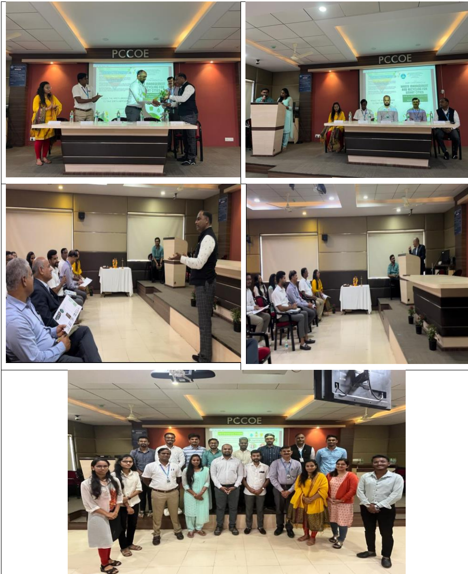
Baby Conference on “Waste Management and Recycling for Smart Cities” theme: The 3R’s of managing Solid Waste on 22 nd July, 2022.