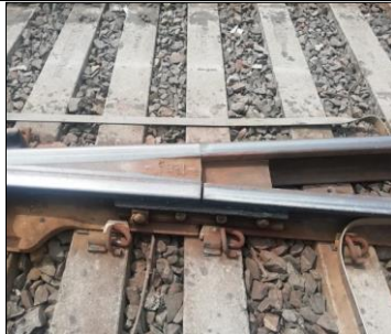
Nosing and crossing