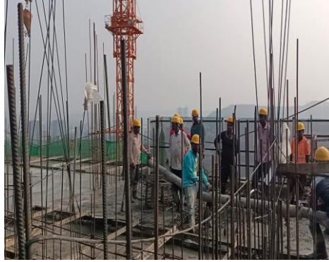
M50 concreting at 22 nd Floor with pumping