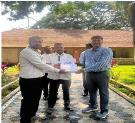
Site Visit at Veer Dam