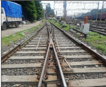
Point and crossing studied at Pune Junction