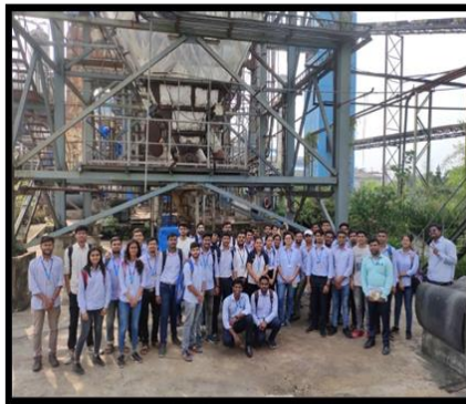
Group Photo at the site

Site visit organized for B.E. Civil students under course 'Air Pollution and Control' at Shri Sant Tukaram Sahakari Sakhar Karkhana Ltd, Mulshi on 30th September, 2022