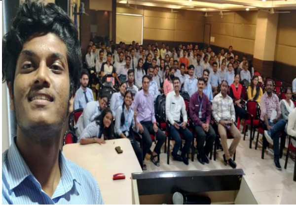
Celebration of Teacher's Day on 6 th September, 2022