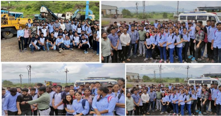
Site Visit to Bituminous hot mix plant at Mangarul Tq, Mawal, Dist. Pune for T.Y. B-tech Civil