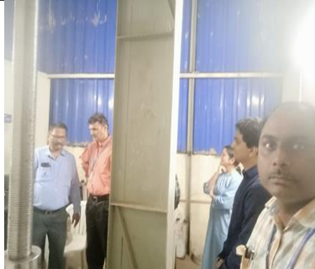
Interactions with NABL Accreditation material testing Lab In charge