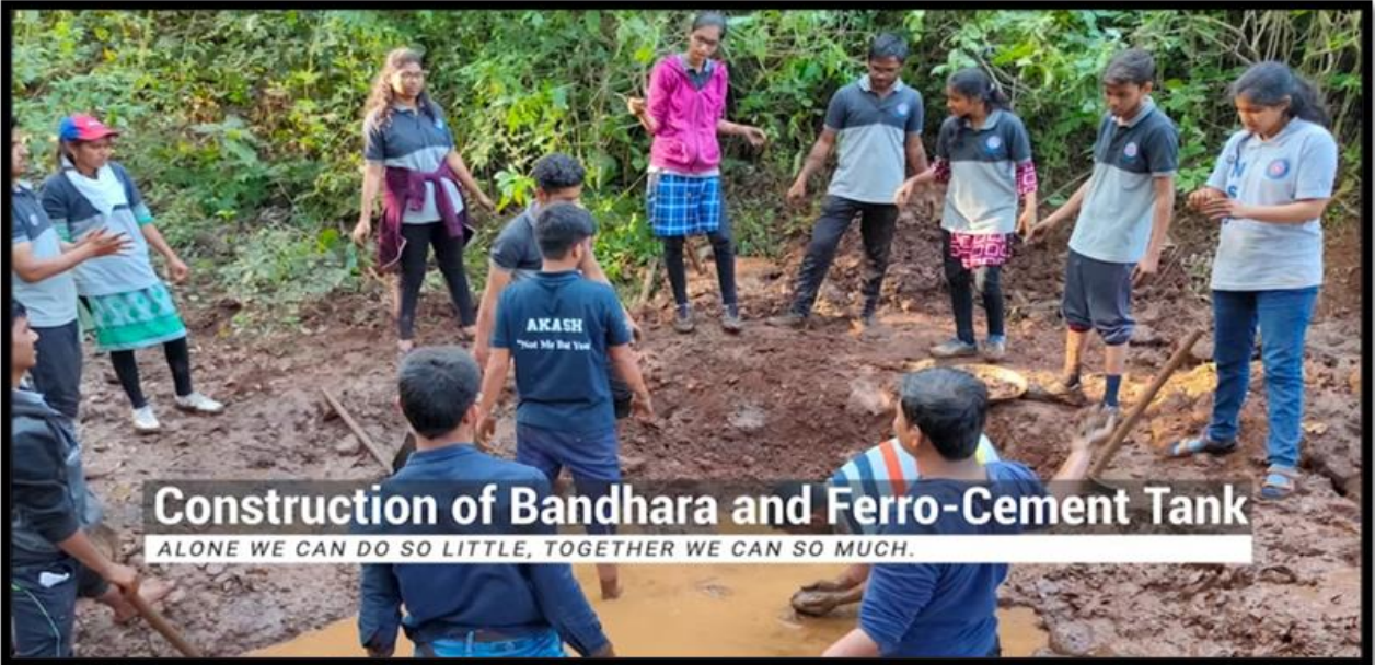
Construction of Bandhara and Ferro-Cement Tank ALONE WE CAN DO SO LITTLE, TOGETHER WE CAN SO MUCH.