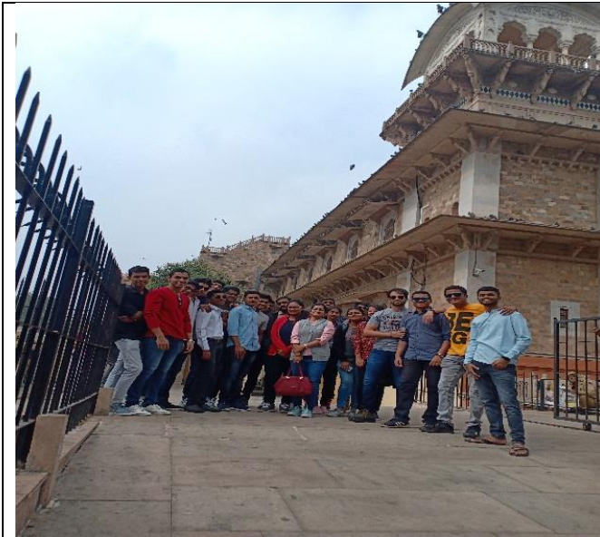
Albert Hall, Jaipur

Successfully conducted the industrial tour for the students of TE Civil at Jaipur, Jaisalmer, Jodhpur from 11/12/2019 to 19/12/2019