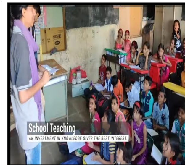
School Teaching at Zilla Parishad School