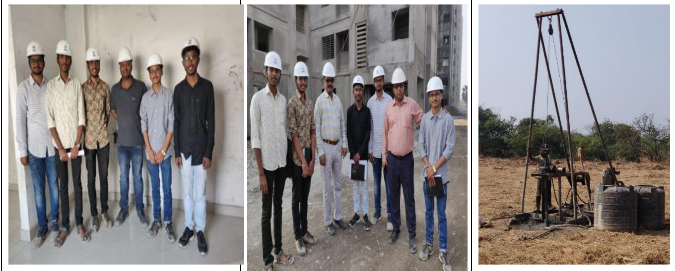
On Site Training of TE Civil Students at Site of B.G Shirke Construction at Mumbai.