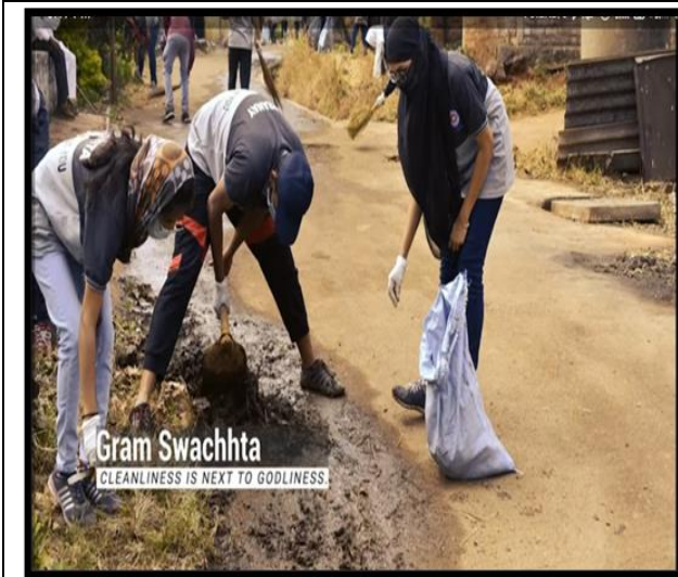
Gram Swachhta at Vadeshwar