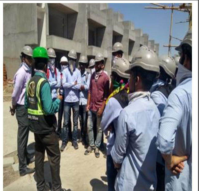
Site visit of BE Civil students at Runal Gateway on 13th March 2020