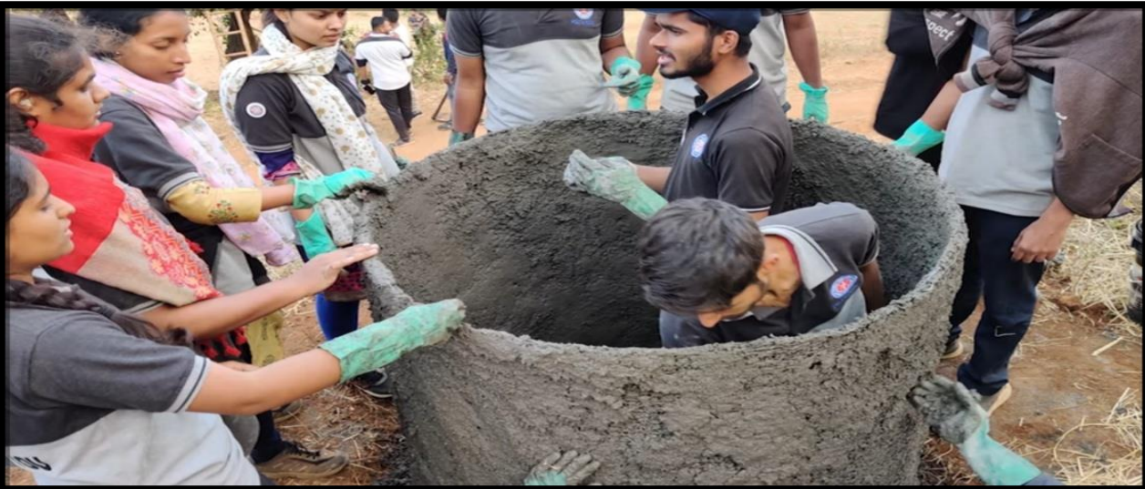
Construction of Ferrocement Tank