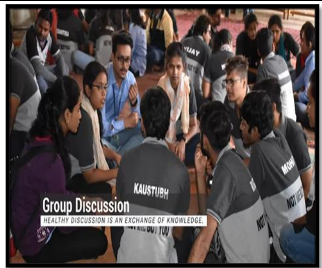
Group Discussions on Social Topics