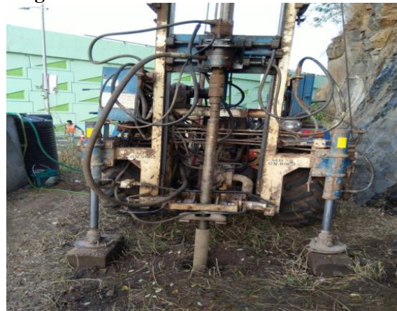
Core drilling machine at site 1