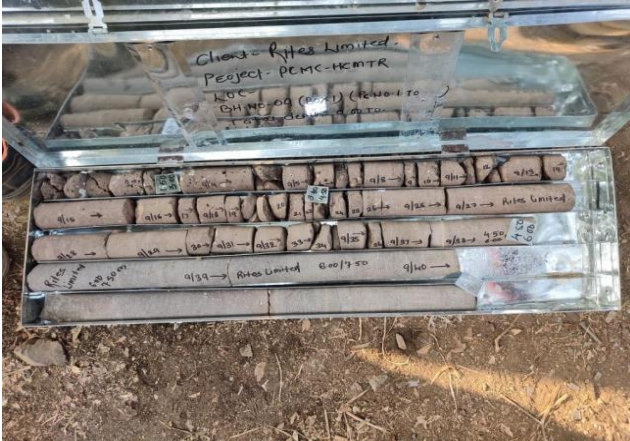
Cores recovered from site 2 kept in core box