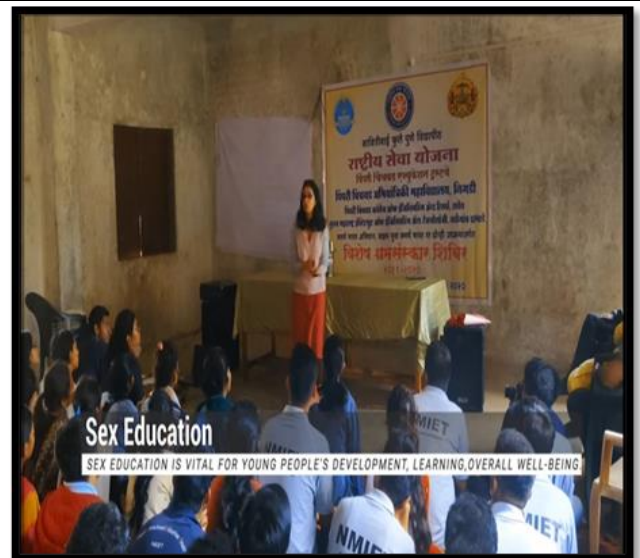
Sex Education to NSS Volunteers