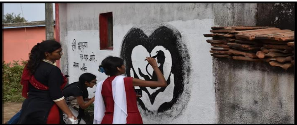
Painting the walls of Village Houses with Social Message