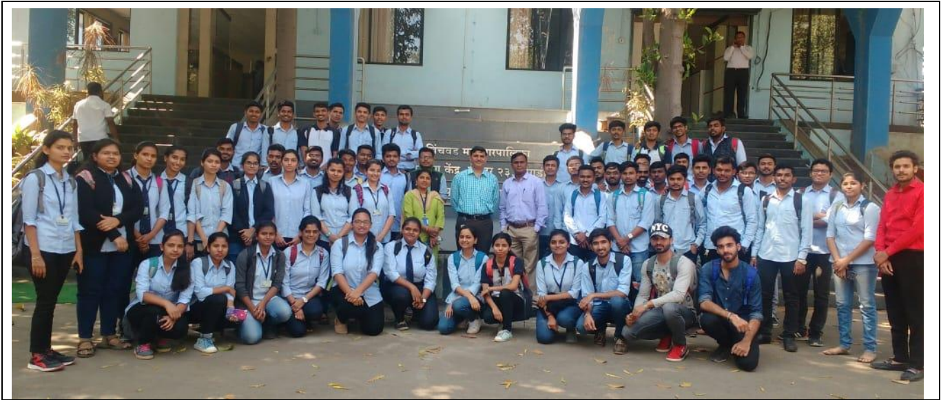
Site visits of TE Civil students at Water Treatment Plant Nigdi, Pune on 6th February 2020