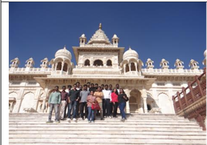
Jaswant Thada, Jodhpur