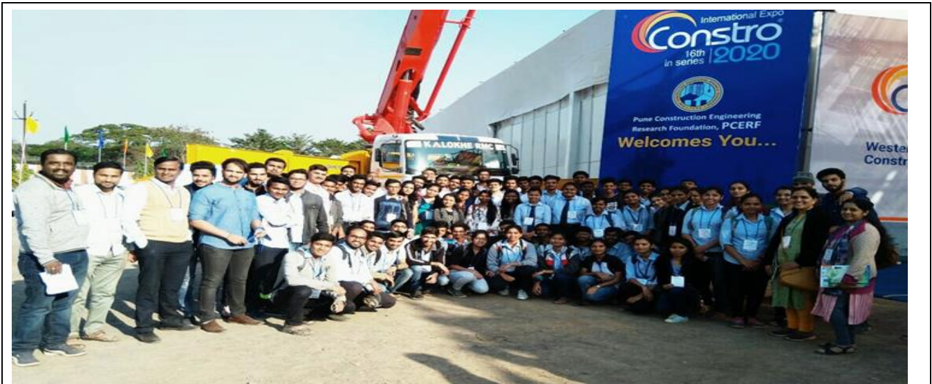
Visit to Constro 2020 of All SE, TE, BE, ME (Construction Management), Faculties and Staff of Civil Department, PCCOE Nigdi on 17 th January, 2020.