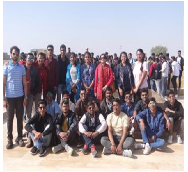
Group photo at Golden Fort, Jaisalmer