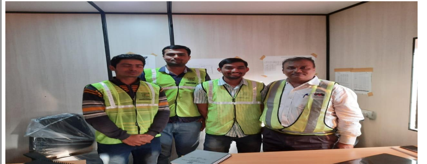
On Site Training of TE Civil Students at Site of Millennium Engineers and Contractors Pvt.Ltd.