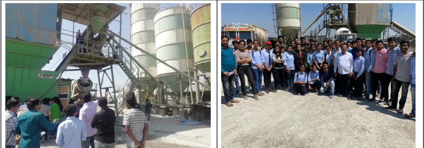
Site visits for SE Civil students at RMC Plant Tathawade Pune on 14 th March, 2020