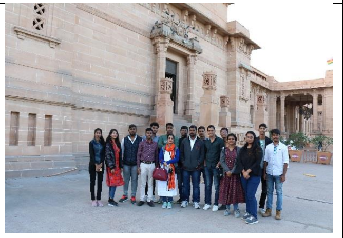
Umaid Bhavan, Jodhpur