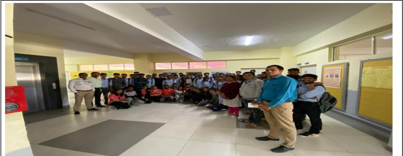
Site visits for SE Civil students at Architectural College Building PCCOE Campus on 07 th February, 2020