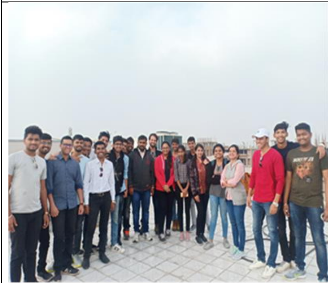
Group photo at Elegant Bungalow site at Sector 6, Vidhyadharnagar, Jaipur